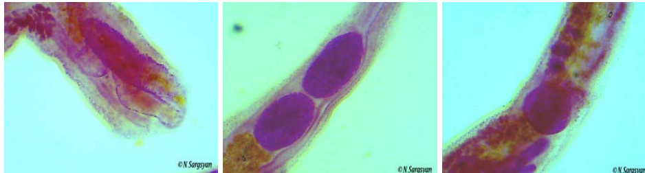
Fig.1. Telorchis assula Dujardin, 1845 (Trematoda: Telorchidae)

Description (based on 5 specimens): Body elongate, 4-4.9 mm long, 0.3-0.4 mm wide. Maximum wide is near acetabulum (ventral sucker). Tegument is spinose. Oral sucker subterminal, nearly round, 0.11 mm long, ventral sucker 0.09 mm. Oral suckerventral sucker ratio: 1:0.81. Distance between oral sucker and ventral sucker centers 0.14 mm. Esophageal bifurcation in the middle of suckers. Testes are postacetabular. Anterior testis is 0.24 mm long, 0.16 mm wide. Posterior testis is 0.27 mm long, 0.16 mm wide. Distance from posterior testis to posterior end of the body is 0.4 mm. Cirrus is elongated, curved and closely to ovary. Ovary is nearly round, 0.15 mm long, 0.147 mm wide. Vitelline fields are lateral. Uterus has raised branches. Eggs are small, 0.02 mm long, 0.16 mm wide.