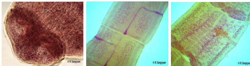
Fig.3 Ophiotaenia europea Odening, 1963 (Cestoda, Ophiotaeniidae)

Sexual paths are in the middle of mature segment and divides testes into right and left fields. Total amount of testes is 170. There are oval 0.06x0.07mm. Invaginated bursae is 0.02x0.12 mm. Ovaries are oval 0.4x0.2 mm and have two wings. Vulvae is 0.1 mm. The number of uterine branches is 32-65. Eggs are oval or round 0.05x0.07 mm.